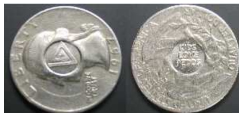
(U) BLogo imprinted on coins