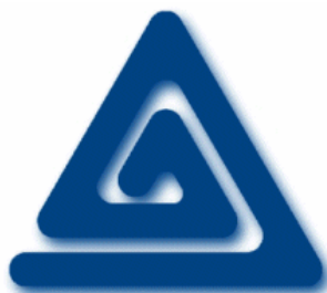
(U) BLogo aka "Boy Lover"