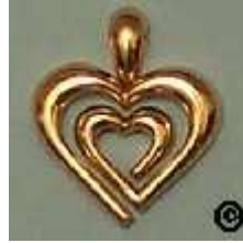
(U) GLogo Pendant

(U) The ChildLover logo (CLogo), as shown below, resembles a butterfly and represents non-preferential gender child abusers. The Childlove Online Media Activism Logo (CLOMAL), also represented below, is a general purpose logo used by individuals who use online media such as blogs and webcasts. 4