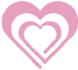
(U) GLogo a.k.a. "Girl Lover," Childlove