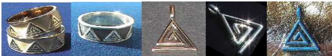
(U) BLogo jewelry