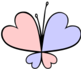
(U) CLogo a.k.a. "Child Lover"